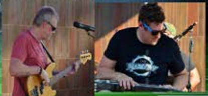
FHS Band, The Marlow Boys Band free food, activities, inflatables